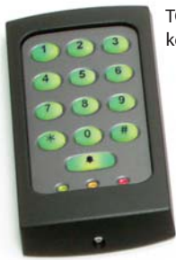
TOUCHLOCK K series keypads